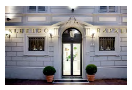
DAY 1: HOTEL RAPALLO, FLORENCE