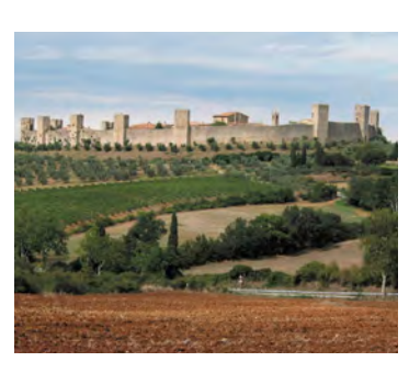
DAY 6: SIENA - MONTERIGGIONI - SIENA

At breakfast fuel up because we tackle a 50 mile loop ride with a stop in Rapolano Terme for lunch and a dip in the hot springs for those sore legs! Return to Siena with time to explore this magnificent renaissance town. Overnight in Siena.