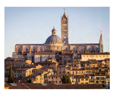
DAY 4: RADDA - SIENA

After breakfast and check out we leave on bikes from Radda and ride to Castellina in Chianti, with time to sightsee, shop and explore this classic Tuscan village, then back on bikes for a ride to the Siena with a special lunch and wine tasting on the way.