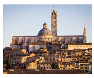
DAY 4: RADDA - SIENA

After breakfast and check out you leave on bikes from Radda and ride to Castellina in Chianti, with time to sightsee, shop and explore this classic Tuscan village, then back on bikes for a ride to the Siena with a special lunch and wine tasting on the way. Overnight in Siena.