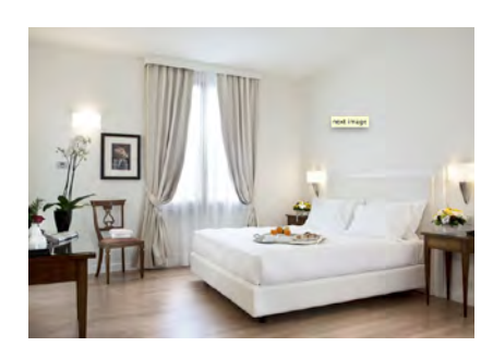
DAYS 4-6: HOTEL ITALIA, SIENA

In a scenic Palace located in Radda in Chianti, an enchanting medieval village embraced by ancient walls, in the heart of gorgeous Siena countryside amidst gentle hills, woods, grapes and olive trees, there you find Hotel Palazzo San Niccolo', a four star hotel, just 30 minutes from Siena. Precious materials, authentic frescoes merged in a magic atmosphere to offer you an unforgettable experience, full of comfort and top quality services. Hotel San Niccolo' is the right place to be ravished by Tuscany charm.