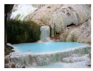
DAY 5: SIENA - CASTELNUOVO BERARDENGA - RAPOLANO TERME - ASCIANO - SIENA

After breakfast and check out you leave on bikes from Radda and ride to Castellina in Chianti, with time to sightsee, shop and explore this classic Tuscan village, then back on bikes for a ride to the Siena with a special lunch and wine tasting on the way. Overnight in Siena.